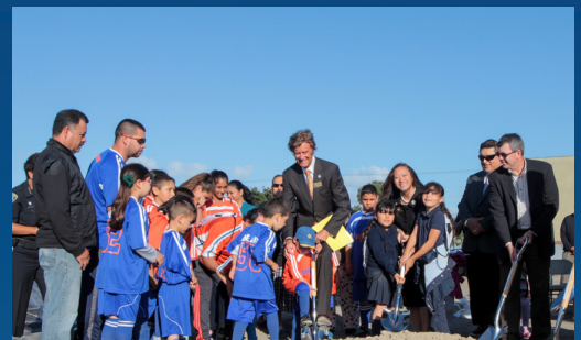
The Rumrill Sports Complex boasts three youth soccer fields, playground, picnic area and a locally operated healthy food vendor.