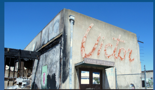
Chico is working to redevelop this key brownfield site as part of a larger effort to support green companies in "The Wedge" business area.