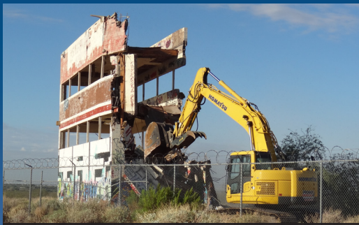
Abatement and demolition at the Beeline Dragway, Scottsdale, AZ.