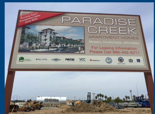
Paradise Creek Apartment Homes are the first sustainably redesigned affordable homes in West-side neighborhood in the City of National City.

At the foundation of this project is the incentivized relocation of industrial uses out of a residential neighborhood. EPA's assessment also included an amortization formula and schedule prioritizing the most polluting and underutilized uses first, which helped the City identify incentive strategies for relocation and closures of non-conforming uses in the neighborhood.