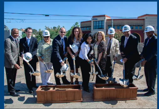
Local, state, and EPA partners participate in community ground breaking event for Trolley Park Terraces.

The Jacobs Center for Neighborhood Innovation is successfully leveraging multiple EPA and non-EPA resources to develop 50-acres in the underserved Diamond/Encanto neighborhoods in San Diego, CA. The development will offer a mix of commercial space and affordable and market-rate housing. After years of extensive community outreach, a 52-unit affordable housing development, Trolley Park Terraces, will provide affordable rental housing adjacent to the transit station. This first phase of redevelopment will create over 150 construction jobs.