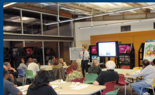
During the development of the Area-Wide Plan for the Del Rio community, extensive community outreach is conducted.

Under the Navajo Nation's EPA-funded program, 36 tribal members completed environmental job training through the Navajo Nation's partnership with Northern Arizona University. The training focused on hazardous materials cleanup and management. Students took additional radiological training to gain the skills necessary to work on the cleanup of former uranium mines on the Navajo Nation.