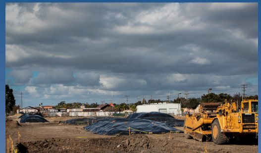
Contaminated soil is removed at the 4.5 acre site that is now the Rumrill Sports Complex.