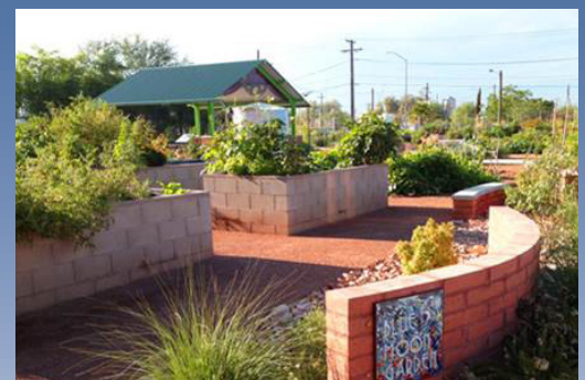
The Blue Moon Community Garden illustrates the conversion of a brownfield into urban agriculture in Tucson, AZ.