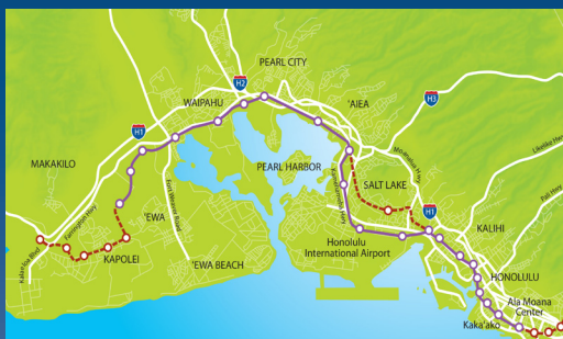
EPA provides funding for 15 environmental assessments at five rail stops from Kapolei to Ala Moana Center in Honolulu.