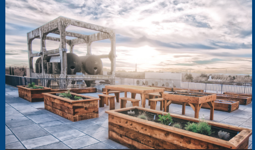
The Warehouse Artist Lofts development is revitalizing the Historic R Street Corridor in Sacramento, CA.

CADA removed 5,000 cubic yards of contaminated soil to a depth of eight feet to safely build apartments on a former brownfield site in Sacramento.