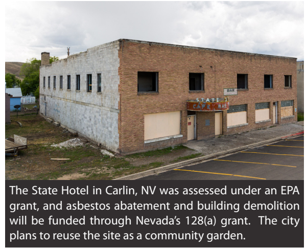
The State Hotel in Carlin, NV was assessed under an EPA grant, and asbestos abatement and building demolition will be funded through Nevada's 128(a) grant. The city plans to reuse the site as a community garden.

The California Department of Toxic Substances Control (DTSC) conducts environmental site assessments to safely facilitate the redevelopment of brownfields sites into schools, housing, retail and open space projects. DTSC also assists brownfields stakeholders by providing crucial environmental due diligence packages to support real estate transactions. Since 2003, $2.5 million in EPA "128(a)" assistance has funded over 90 environmental assessments in California communities. In addition to this state-wide funding, DTSC received a $400,000 EPA Brownfields Assessment Grant in 2015 to conduct environmental site assessments in underserved communities along the I-710 Freeway in Southern California.