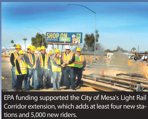
EPA funding supported the City of Mesa's Light Rail Corridor extension, which adds at least four new stations and 5,000 new riders.