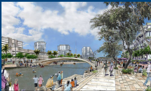
Transit-oriented development is planned along Honolulu's rail transit corridor.

Brownfields Environmental Assessments evaluate the historic use of a property, the likelihood of contamination and, if appropriate, the types and extent of contamination through testing. EPA's Assessment grant will also fund community outreach and cleanup planning.