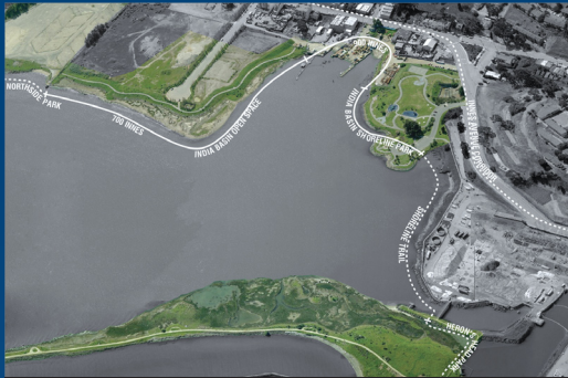
India Basin Waterfront's proposed park provides open space and bay access in an underserved community.