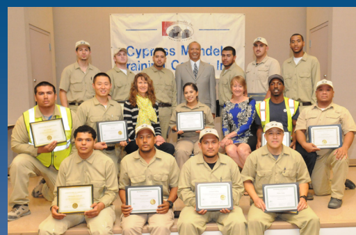
Graduates from Cypress Mandela earn state and federal certifications in environmental management.