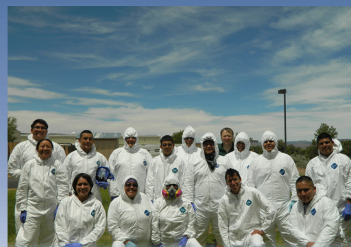
Navajo Nation students complete HAZWOPER training at Northern Arizona University.