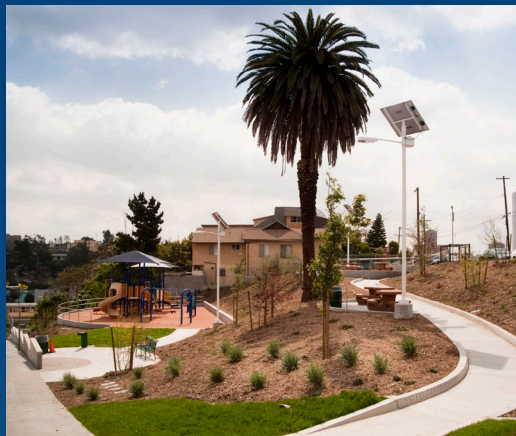
A former petroleum-contaminated site, the Rockwood-Colton Park in Los Angeles has solar lighting and other sustainable features.

The historic town of Samoa, located in the northern peninsula of Humboldt Bay in northern California, is the focus of a lead-contaminated soil cleanup in an area of more than 250 acres. A developer with a vision to restore Samoa and create a vibrant historic community purchased the entire town in 2000. Since 2007, the County of Humboldt has managed an EPA Revolving Loan Fund Grant totaling $2.16 million. The County loaned a developer funding to cleanup lead-contaminated soils and lead-based paint in 100 homes. This project will ultimately preserve historic structures, including the Samoa Cookhouse, and create affordable housing.