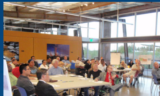
A diverse group of stakeholders gather at the Nina Mason Pulliam Rio Salado Audubon Center, which is within the target area for the Del Rio Area-Wide Planning Grant.