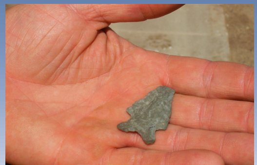
Historic preservation work at Fort Lowell uncovered 73 archeological features from periods spanning 1,000 years.