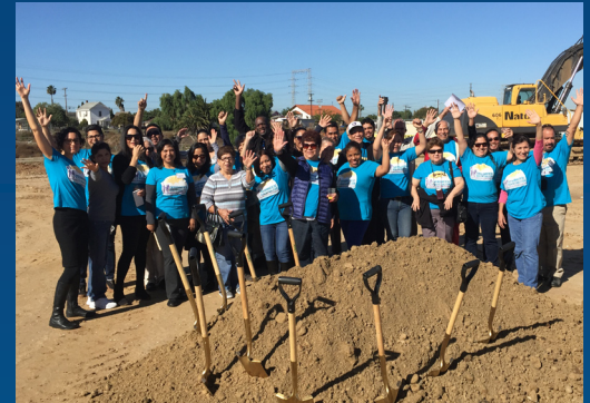
Community members celebrate the groundbreaking of the Paradise Creek project.