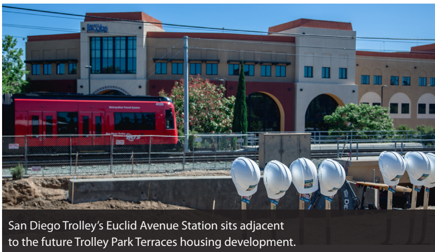
San Diego Trolley's Euclid Avenue Station sits adjacent to the future Trolley Park Terraces housing development.