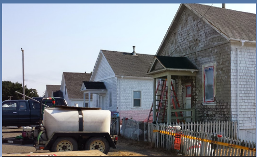
Lead-based paint that peeled off old homes in the historic mill town of Samoa created a health hazard by contaminating soil in the surrounding area.