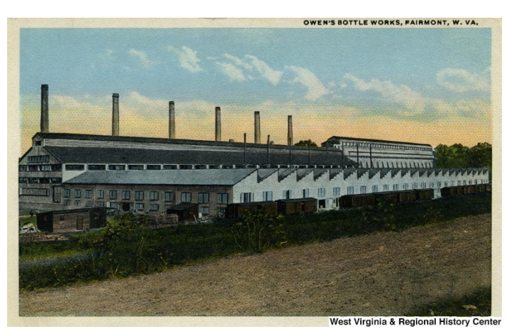
Owens Illinois Glass Factory.

Merit Development, Inc. is planning to locate the new Speedway Business Park on the site of the former Owens-Illinois Glass Factory in Fairmont, West Virginia. Established in 1910, the factory housed six glass furnaces and six bottle machines. When operating at peak production, the factory produced over 180,000 glass bottles daily and employed over 1,000 people. By 1978, Owens-Illinois began to phase out operations and by 1980 nearly 700 of the employees were laid off. The plant shut down in 1982 when the company moved all operations to Texas.