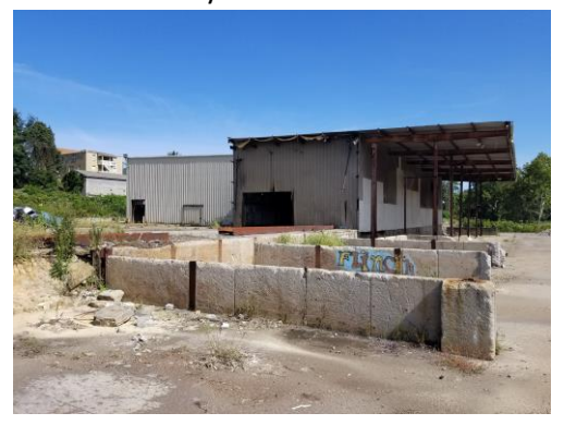
Remnants of the Scrap Recycling Operation

Located east of downtown and just off of I-79, the site is one of the largest easily accessible sites in the region. It is also being marketed as the flattest large property in the state that is available for development. The entire property is zoned industrial; in Fairmont this zoning code allows uses from single- and multi-residential to light manufacturing. The current conceptual site plan calls for 113,000 square feet of retail, 67,000 square feet for industrial uses, and 48 residential multi-family units. Final site use may not be determined until an anchor tenant is identified. Merit is working with Black Diamond Realty to better undersntd the commercial demand. The remaining land (points 2, 6, 7, 12 and