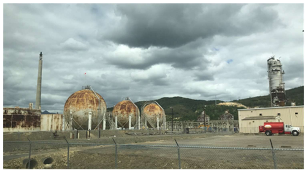
Above ground storage tanks in the PR 127 Corridor

For sites polluted prior to the 1980s, insurance policies may cover the costs of environmental remediation. In some cases, cleanup costs may be too low for insurance recovery to be worth pursuing, as sizeable deductibles (up to $1M) are common for most insurance cost recovery policies. Once more information is obtained for the properties and cleanup costs have been estimated, DISUR or DDEC should consider legally pursuing the former polluting site owners to compel them to remediate the properties.