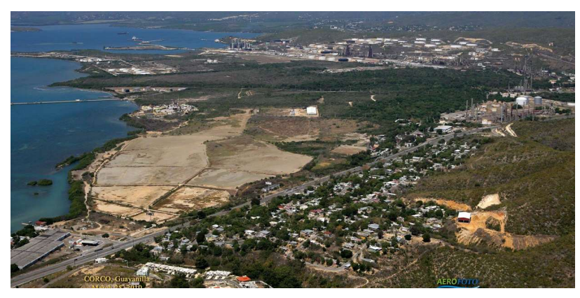
Aerial of PR 127 Corridor.

Puerto Rico's 127 Corridor is located on the south coast of the island and belongs to the municipalities of Peñuelas and Guayanilla. This region was once a fertile agricultural area used to produce sugarcane and coffee. In the 1950s, oil refining companies and related industries began locating near the coast. The island's location made it an ideal refining station for South American oil imports to the U.S. throughout much of the 20th