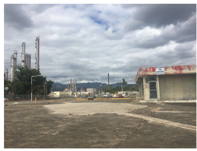
Former gas station in PR 127 corridor

The heavy industrial use of the Corridor has marked the coastal landscape with a vast number of tank farms, towers, and industrial ponds. Under the Area Wide Planning grant, DISUR completed Phase I environmental assessments on 11 of 16 sites targeted for cleanup. The Phase I reports indicate the likely presence of many petroleum related contaminants, PCBs, lead-based paint, and hazardous materials, including asbestos. It is probable that a significant amount of cleanup is needed at many sites. However, efforts should be made to determine which sites, and portions of sites, are relatively uncontaminated or