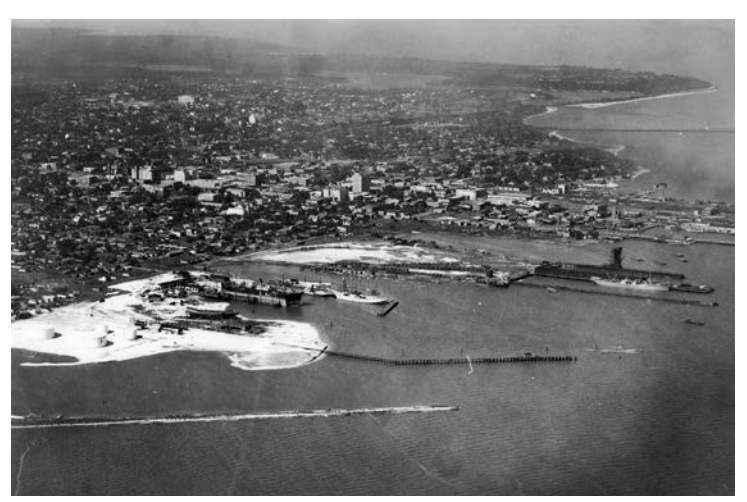
Pensacola's Bruce Beach and Frisco Docks, now home to the Community Maritime Park, in 1922.

The marina will also increase the City's opportunities for tourism. The Tall Ships Challenge, an event that Pensacola will host for the first time in 2018, brings "traditionally rigged sailing vessels" into the region to showcase the community's maritime history. Events like this one will benefit from having a marina and a nearby park that can accommodate both a variety of vessels and a large number of people. Before the City can develop a marina, however, the submerged pilings and all other debris must be removed to clear a path for boats to safely access the shore.