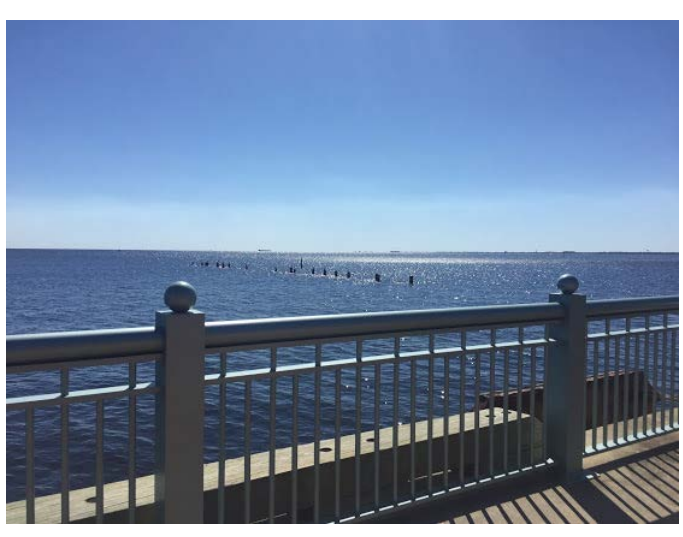
View from South End of Maritime Park Peninsula with Pilings

As mentioned above, the City has already secured over $450,000 for cleanup and FDEP is picking up the cost of waste disposal from the site. Recent investigations by divers have indicated a large amount of other debris accumulated by dumping over the years. The City should focus initial cleanup efforts on the removal of pilings where ingress and egress channels will accommodate movement of large vessels (e.g., tall ships). This would require careful planning based off of the adopted design for the marina and placement of mooring field, etc. The City should map the overlay of existing pilings with the design for the future ingress and egress channel to determine where cleanup needs to occur first,