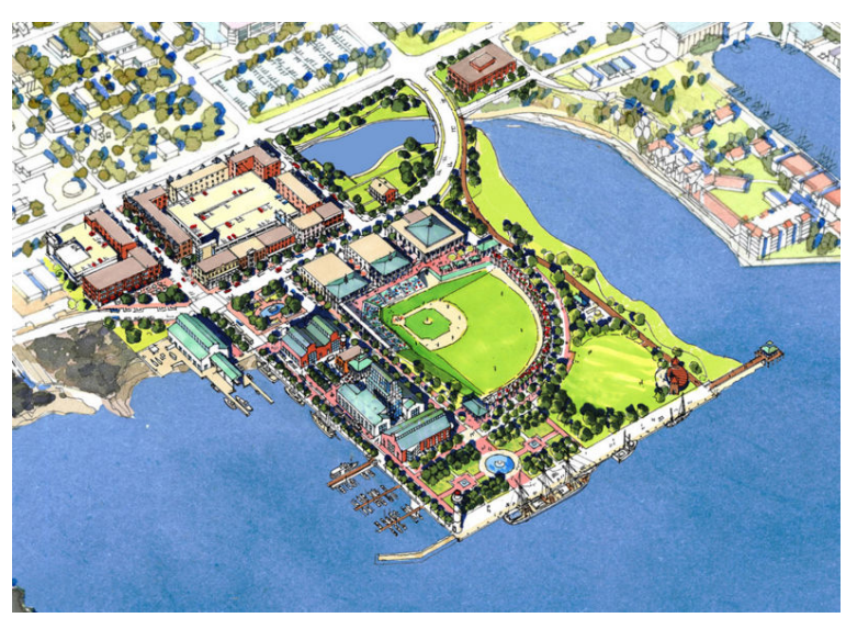
The Community Maritime Park; Rendering courtesy of the City of Pensacola

The Community Maritime Park sits on a 32-acre peninsula in downtown Pensacola, overlooking the Pensacola Bay. Today, the park includes plentiful greenspace, a public promenade, a playground, amphitheater, office buildings, and an award-winning Double-A ballpark completed in 2012.1 The park is part of the City's ongoing efforts to revitalize downtown Pensacola. Nearby waterfront restaurants and condominiums contribute to the attractiveness of the area. This rapidly developing corridor celebrates Pensacola's identity as a historic maritime center while targeting private investments including