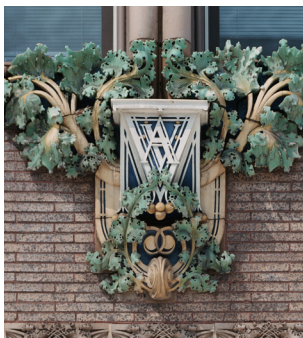
Van Allen and Son Department Store, Clinton, Iowa (1913-1915).