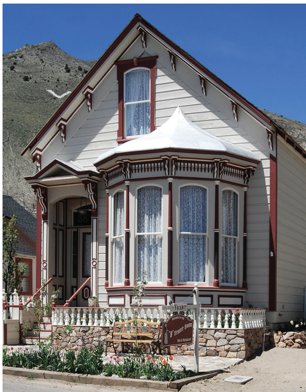
58 B Street, Virginia City, Nevada (1875). Rehabilitated as a bed and breakfast.

The NPS reviews the rehabilitation project for conformance with the “Secretary of the Interior’s Standards for Rehabilitation,” and issues a certification decision. The entire project is reviewed, including related demolition and new construction, and is certified, or approved, only if the overall rehabilitation project meets the Standards. These Standards appear on pages 24-25. Both the NPS and the IRS strongly encourage owners to apply before they start work.