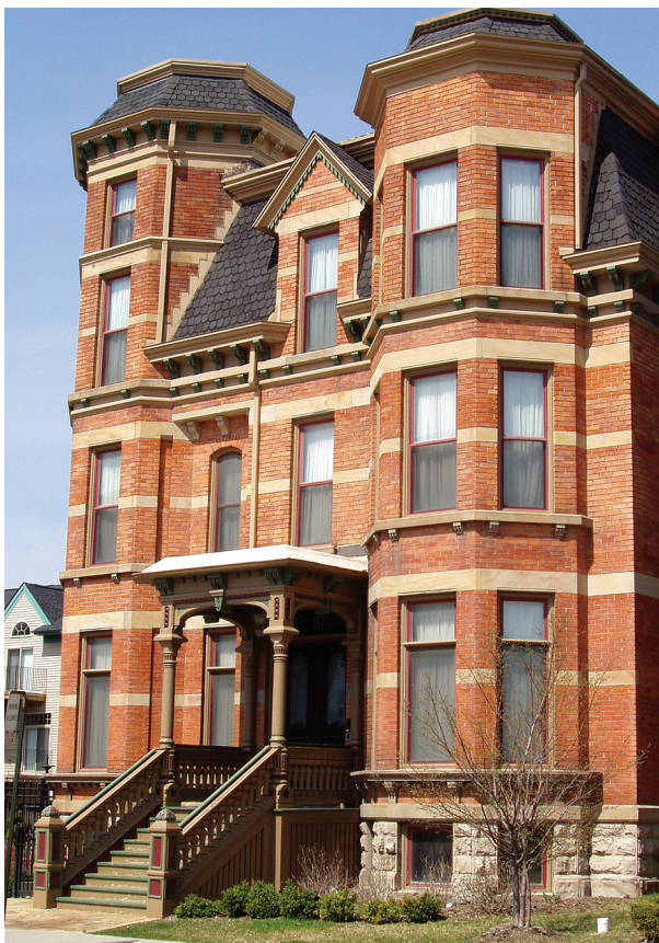
John Harvey House, Detroit, Michigan (1875). (opposite) Before rehabilitation; (above) After rehabilitation as a bed and breakfast.

limited partnerships, cannot be used to offset tax liability from “active” sources such as salaries. This passive activity limitation does not apply to: