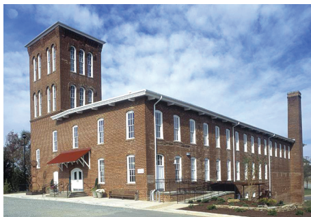
Prizery/R.J. Reynolds Tobacco Warehouse, South Boston, Virginia (1900). Rehabilitated for commercial use.

The NPS or the SHPO may inspect a rehabilitated property at any time during the five-year period. The NPS may revoke certification if work was not done as described in the Historic Preservation Certification Application, or if unapproved alterations were made for up to five years after certification of the rehabilitation. The NPS will notify the IRS of such revocations.