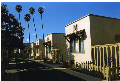
Hollywood Bungalow Courts, Los Angeles, California (1921-1925). Rehabilitated as housing for special-needs and low-income residents.

The NPS charges a fee for reviewing applications. Fees are charged for the review of proposed work (Part 2) and for review of completed projects (Part 3). The fees are based on the rehabilitation costs. Payment should not be sent until requested by NPS. The NPS will not issue a certification decision until payment has been received. See the NPS website on page 26 for the fee schedule.