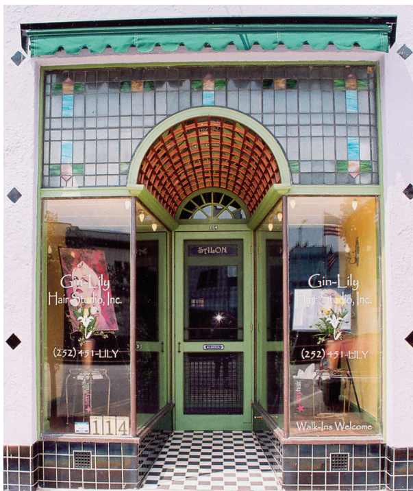
114 NW Main Street, Rocky Mount, North Carolina (1928).