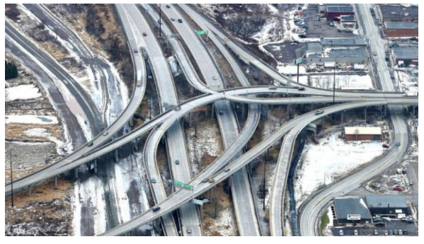
Aerial view of the "can of worms" interchange along Interstate 35 in Duluth.

grants are highly competitive. Projects with multi-modal and multi-jurisdictional components are given special consideration. Although not appropriate for the Lot D redevelopment, the BUILD grant may be an option for the larger connectivity issues to and from the site: improvements to Railroad Street, detangling of the "can of worms" caused by multiple on/off ramps to Highway 35 near the site and connecting Lot D via streets and pedestrian trails to the Canal Park District.