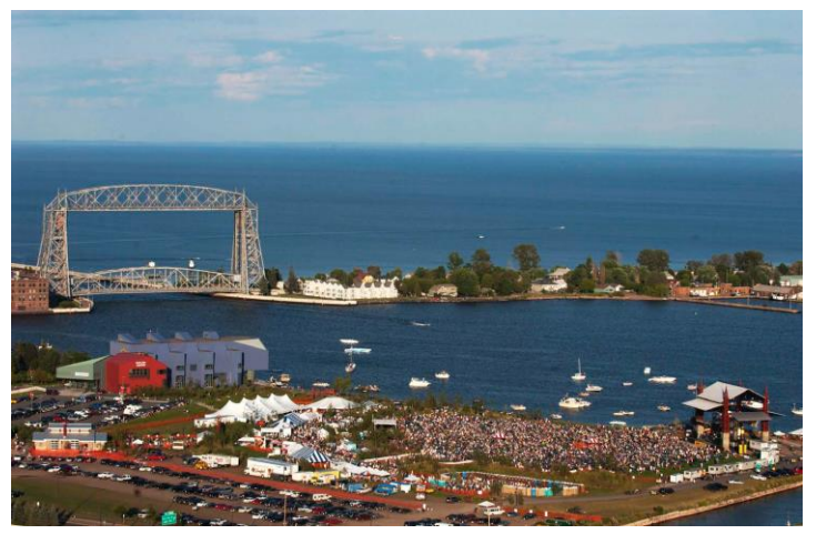
The Duluth Aerial Lift Bridge was originally constructed in 1905 resembling a ferry bridge in Rouen, France- the only other one of its kind in the world. The lift was added in 1930.

In 2016, the City issued a Request for Proposals for the redevelopment of Lot D. The Developer selected for the project has proposed 300 units of high-end housing with commercial, retail, and restaurants on the site. The property will